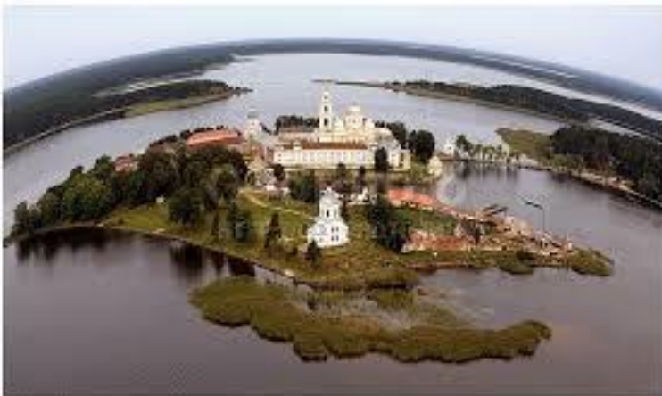
The famous island Monastery of St. Nil of Stolobenskii in Tver region