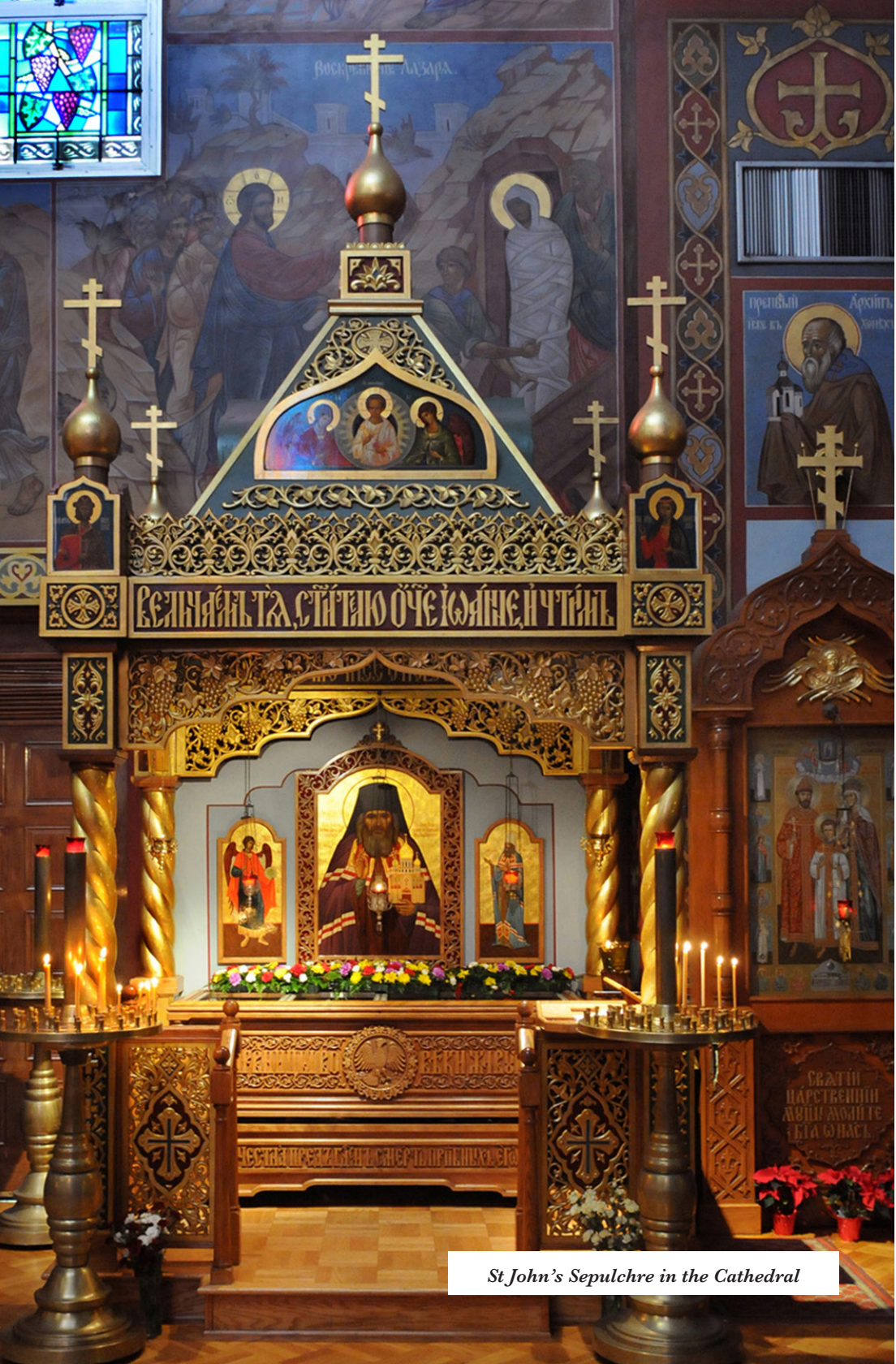
St John's Sepulchre in the Cathedral