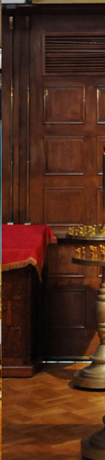
Holy Virgin Cathedral, San Francisco