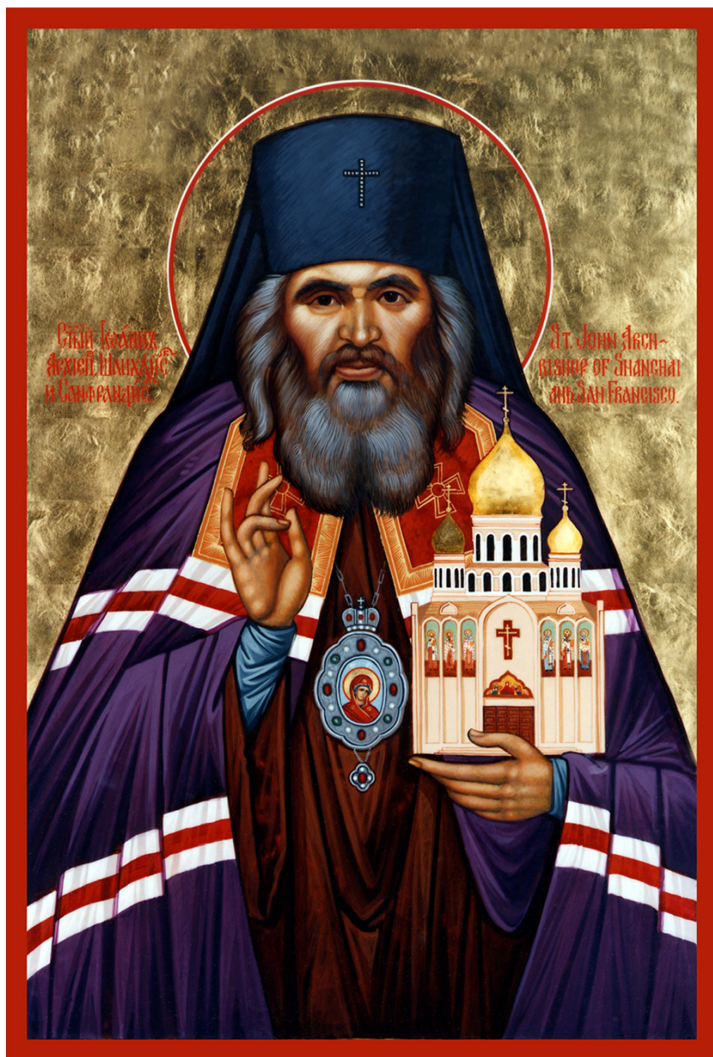
Св. ИОАНН, Шанхайский и Сан-Францисский чудотворец St. JOHN, Wonderworker of Shanghai & San Francisco